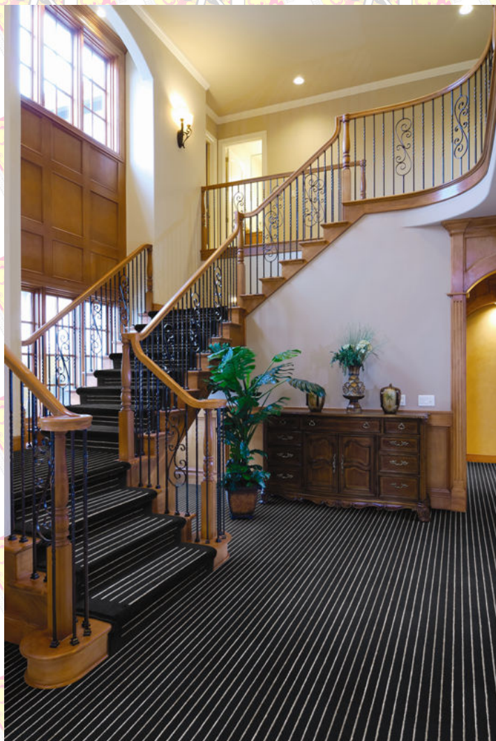
CORDUROY/BLACK - BROADLOOM

"Corduroy" Collection is part of a new assortment of transitional/contemporary designs made of New Zealand Wool with Art Silk accents. Designed with the higher end consumer in mind, this design features multiple width stair/hall runners, and matching/coordinating 13'2" broadloom.