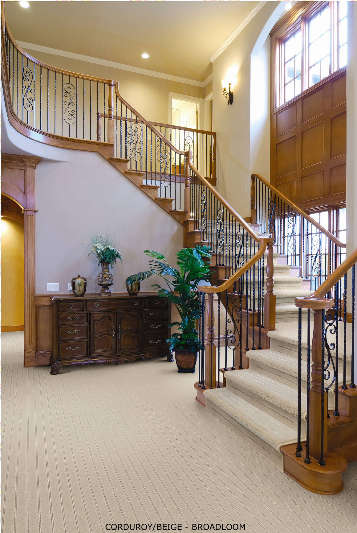
CORDUROY/BEIGE - BROADLOOM