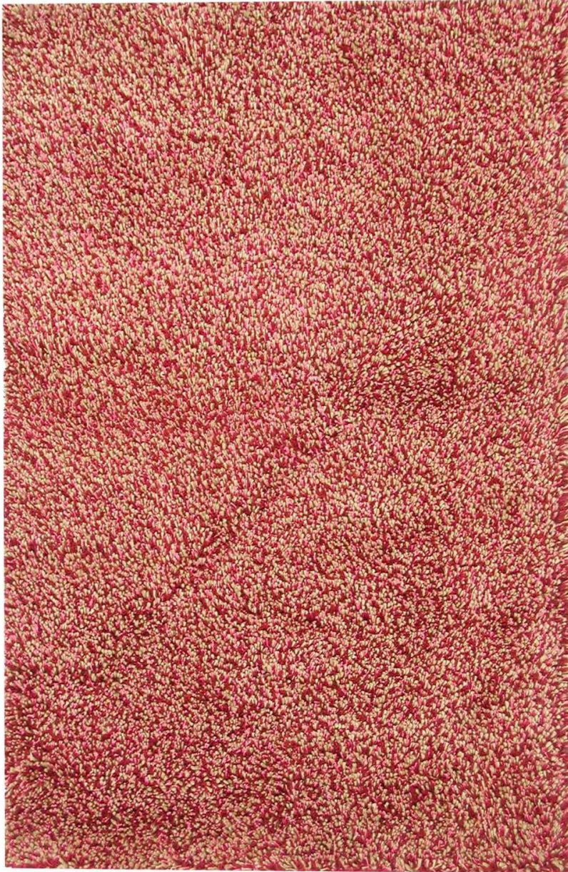
SHOWN - RED MULTI