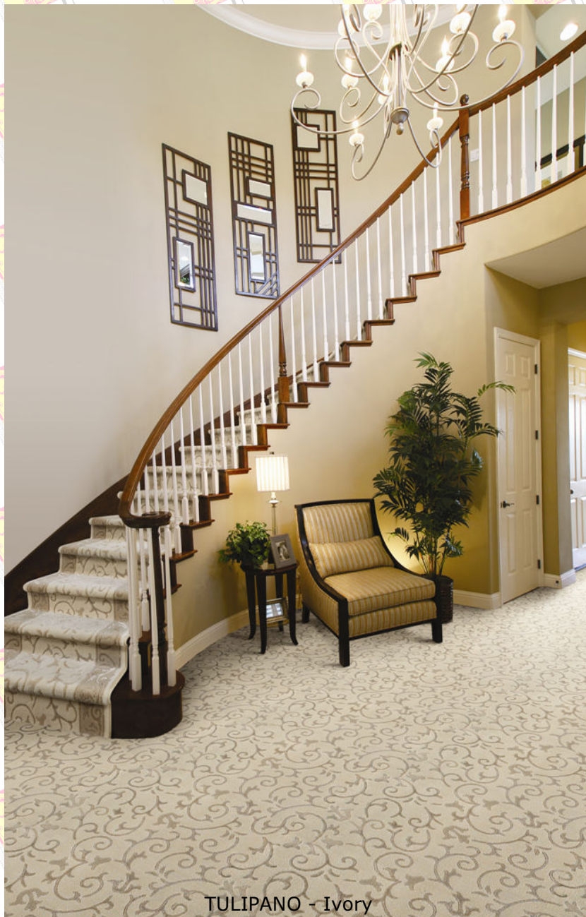
TULIPANO - Ivory