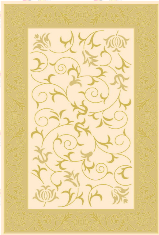
5'3" x 7'9" Area Rug